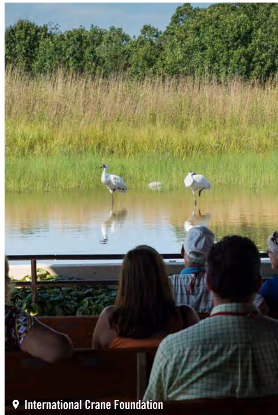
📍 International Crane Foundation