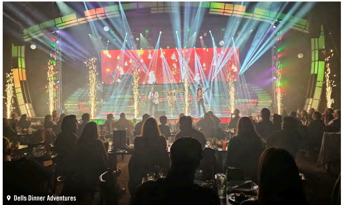
📍 Dells Dinner Adventures

This state-of-the-art theater provides year-round entertainment with shows ranging from tribute performances to Sneaky Pete's Wild West Dinner Show and holiday-themed performances. Everyone, regardless of their age, is sure to be on the edge of their seat waiting to see what happens next!