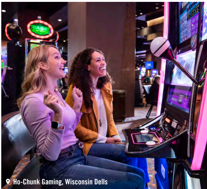
📍 Ho-Chunk Gaming, Wisconsin Dells