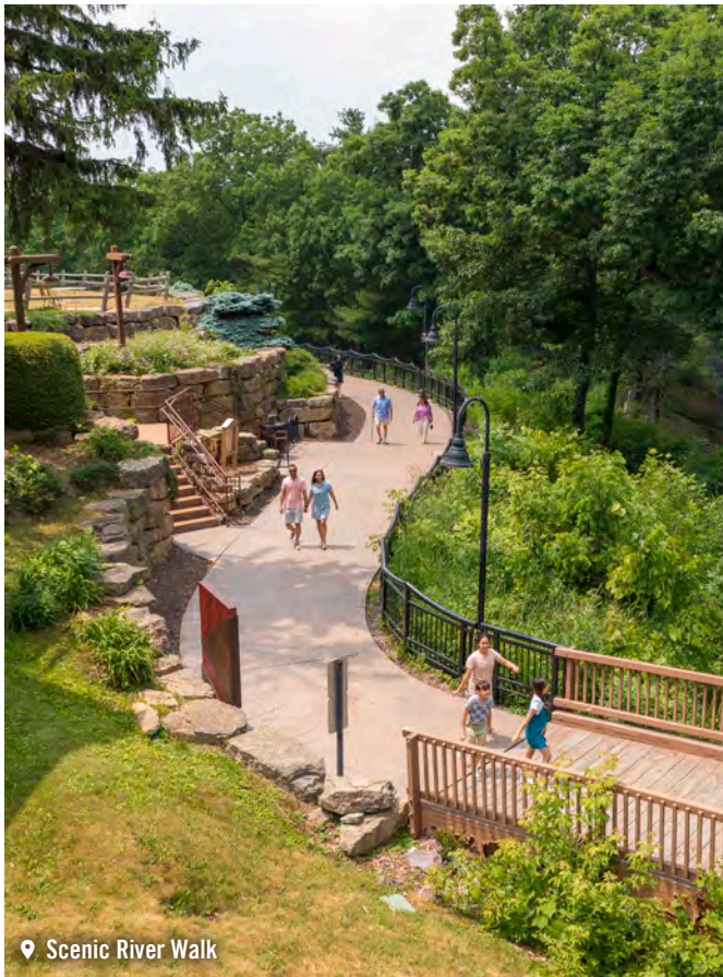
📍 Scenic River Walk