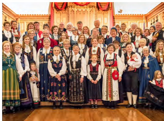
Traditional Norwegian Bunads