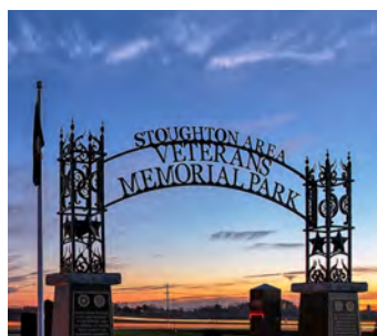
Stoughton Veterans Memorial Park