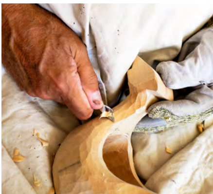
Norwegian Wood Carving