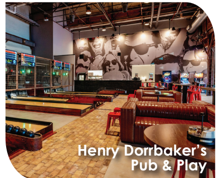
Henry Dorrbacker's Pub & Play

WHY BELOIT, WISCONSIN? Beloit is a robust community with plenty of activities for our visitors to experience. We have a vibrant, active arts community, locally-owned restaurants, lively farmers' market, a revitalized downtown, and so much more! We are proud of our city's friendliness and hospitality and strive to make sure all of our guests have a memorable visit. There are great places to stay, eat, shop, visit, and explore all year round! Beloit is conveniently located at the intersection of I-39/90 and I-43. We can accommodate groups of all kinds; from day-trips to overnight, along with hub and spoke seekers and weary travelers looking to stretch their legs during a long journey. We look forward to hosting you in our beautiful city!