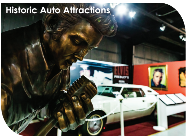
Historic Auto Attractions

Write Your Story in Beloit Chapter 1: Take a tour at BECKMAN MILL , an authentically restored, operational 1868 Grist Mill. Chapter 2: Explore Downtown Beloit stores like BUSHEL & PECK'S , NORTHWOODS PREMIUM , BATH & BODY FUSION , and more. Scavenger hunts, pre-purchased items, or free time to wander. Chapter 3: Take some time to refuel at one of these great options! Chapter 4: Act like a kid again at HENRY DORRBAKER'S PUB AND PLAY with duckpin bowling, mini-golf, classic arcade games, and more. Chapter 5: Soak in the history at one of our fabulous museums like HISTORIC AUTO ATTRACTIONS (so much more than just cars!), WRIGHT MUSEUM OF ART , or LOGAN MUSEUM OF ANTHROPOLOGY . Chapter 6: Savor a locally made beverage at DC ESTATE WINERY , G5 BREWING COMPANY , or CHEEZHEAD BREWING . Epilogue: This is your story, so choose your own adventure. Contact me for assistance in crafting the perfect story!