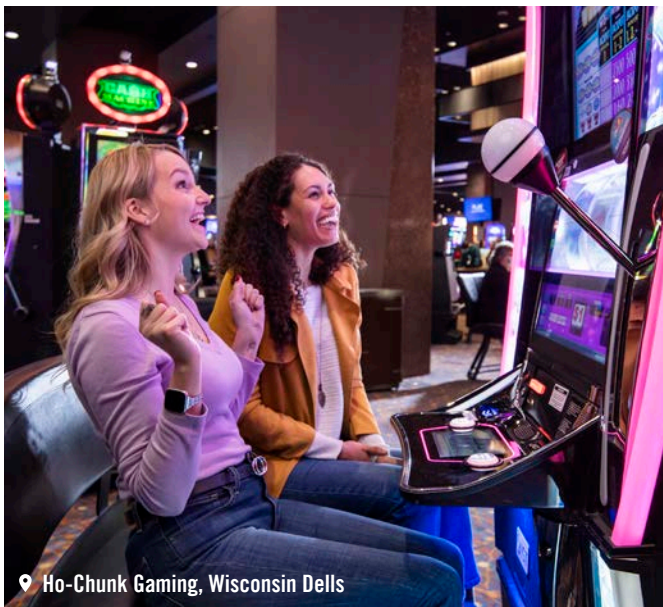
Ho-Chunk Gaming, Wisconsin Dells