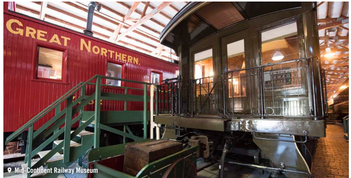
Mid-Continent Railway Museum

Mid-Continent Railway Museum is an outdoor, living museum and operating railroad recreating the small town/short line way of life during the "Golden Age of Railroading," spanning the years 1880-1916, with operating trains, education exhibits, and displays of restored rolling stock.