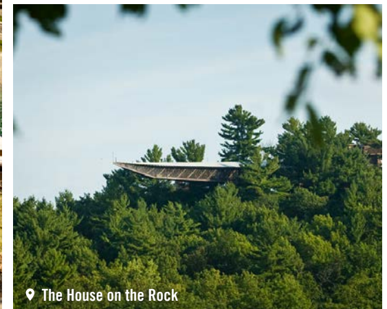
The House on the Rock