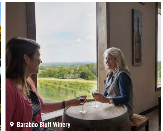
Baraboo Bluff Winery