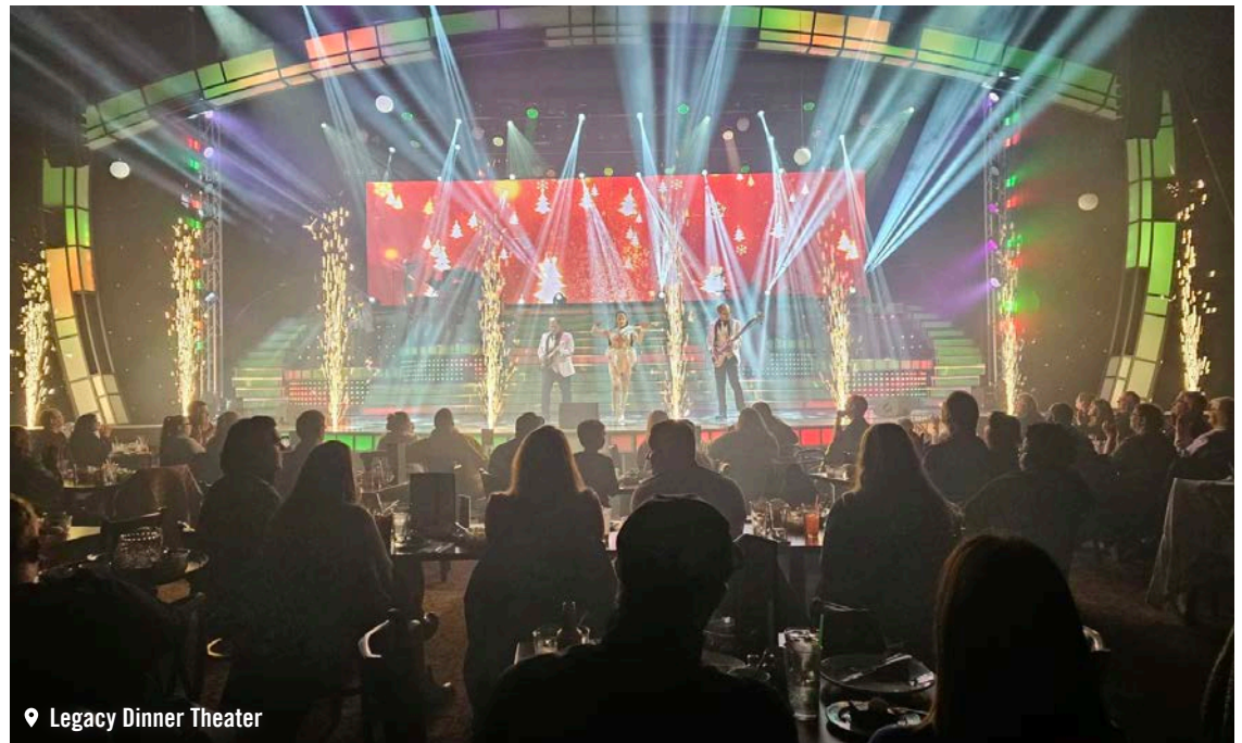
📍 Legacy Dinner Theater

This state-of-the-art theater provides year-round entertainment with shows ranging from tribute performances to Sneaky Pete's Wild West Dinner Show and holiday-themed performances. Everyone, regardless of their age, is sure to be on the edge of their seat waiting to see what happens next!