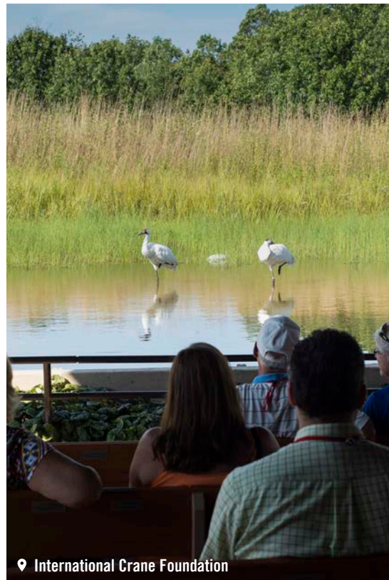
📍 International Crane Foundation