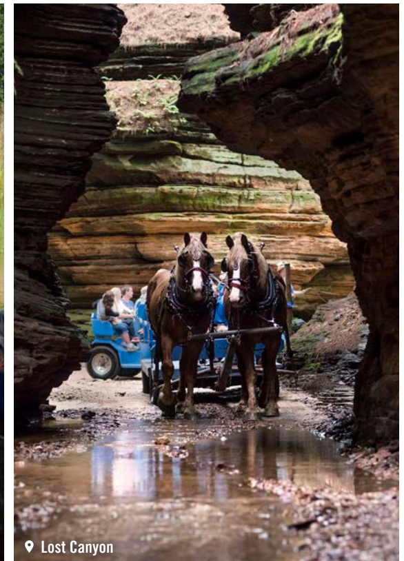
📍 Lost Canyon