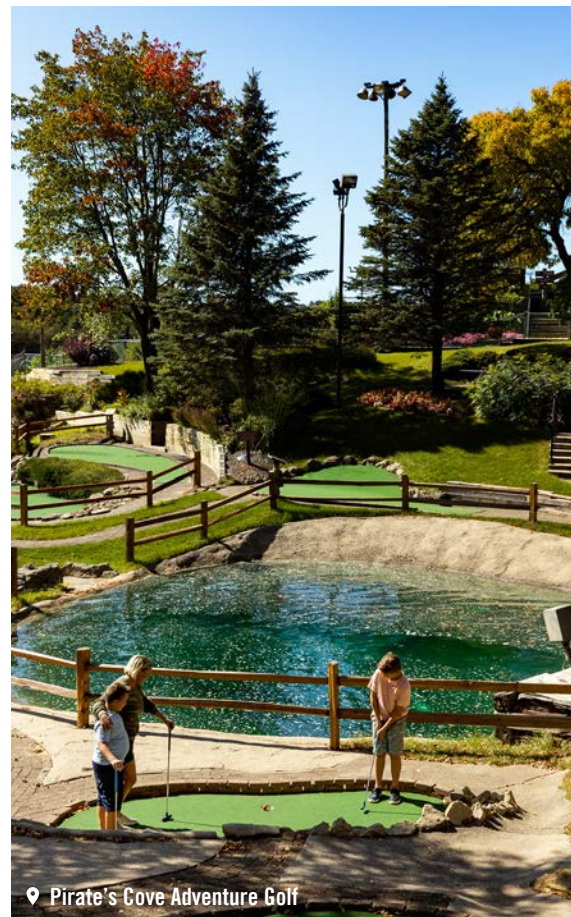
Pirate's Cove Adventure Golf